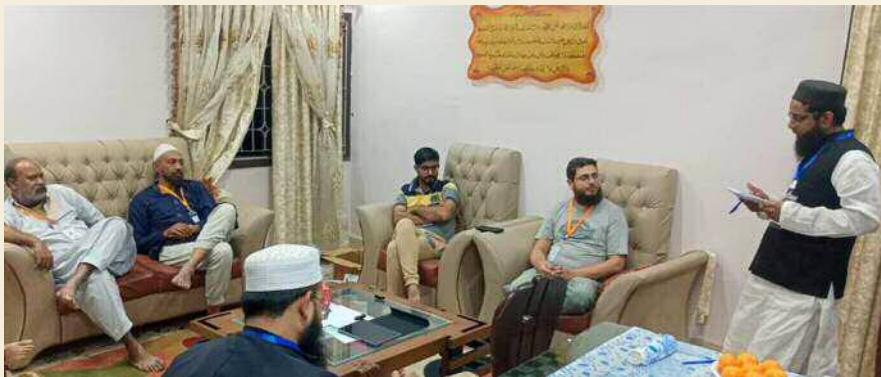
Focus group discussion for EMPOWER-D being conducted by BIDE.

On February 25th, 2024, a Focus Group Discussion (FGD) for the EMPOWER-D was conducted with male participants, focusing on the topic "From Community without Diabetes." The session took place in the comfortable setting of one of the participants' homes, providing a relaxed and conducive environment for open discussion. Ten individuals actively participated in the FGD, contributing a diverse range of perspectives and experiences.