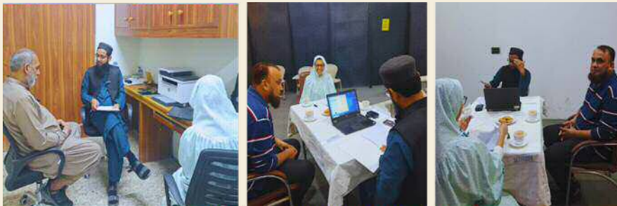
Pilot qualitative interviews being conducted for EMPOWER-D at BIDE.

Pilot Qualitative interviews for the EMPOWER-D initiative were conducted at BIDE from February 14-19, 2024. The sessions were thoughtfully organized to capture a broad spectrum of perspectives on diabetes. Interviewees included people without diabetes, community representatives, carers of individuals with diabetes, and those living with diabetes, thus providing great insights about diabetes.